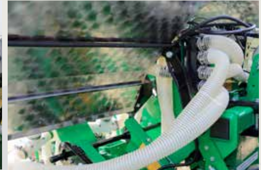
Pneumatic fertilizer spreader