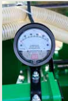
Large Vacuum Gauge for easy control