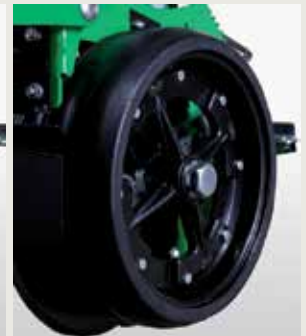
Large rubber spoke wheels 400x115