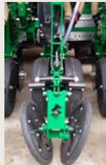
Back compression wheels 1" x 13"