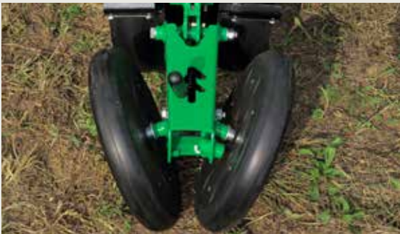
Easy adjustment of back wheels pressure