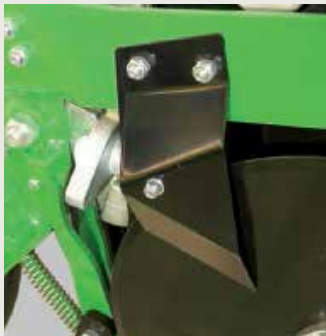
Scrapers, internal and external, for double discs opener