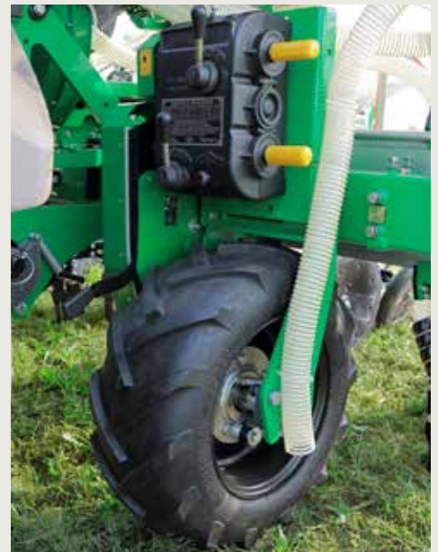
Front Drives Wheels, Gear- Shift Lever, Easy and Quick tractor range shift.