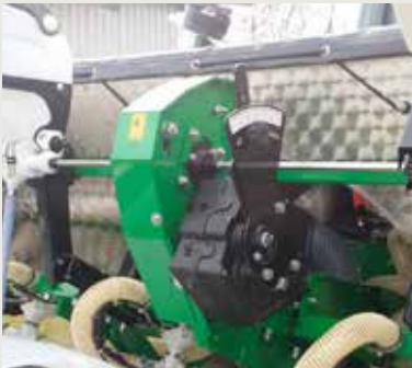
Microgranulator drive transmission version Plus, with 3 cams variator