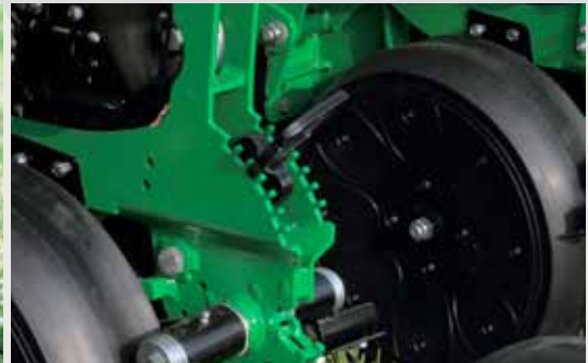
Easy and quick adjustment of sowing depth