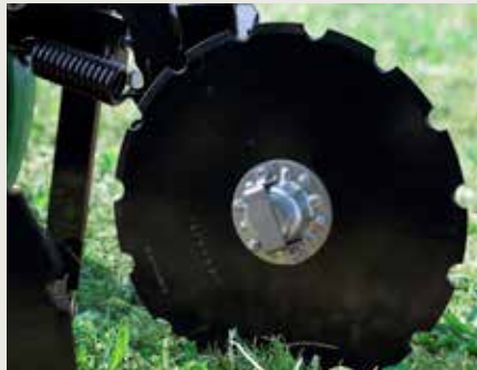
Fertiliser Double Disc, mounted directly on the plating unit for a constant distance of fertilizer deposition compared to seed position