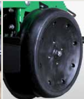
Large rubber depth wheels 400x115 Available in tight version 400x60