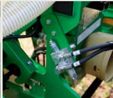
Pressure Relief Valve for the beam