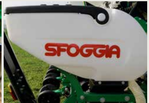
Seed Hopper of 58 liters. Versions of 30 liters are also available.