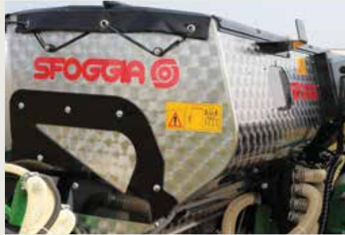
Stainless Steel Fertiliser Hopper of 900 liters, with volumetric distributors Sfoggia