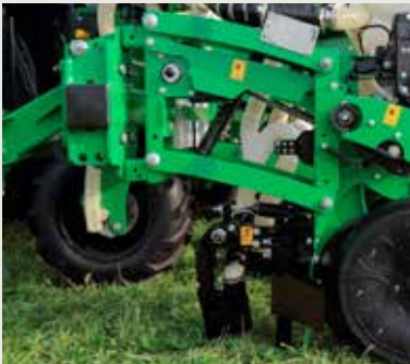
Fertiliser Coulters, directly mounted on the sowing planting unit for a constant distance of fertilizer deposition compared to seed position