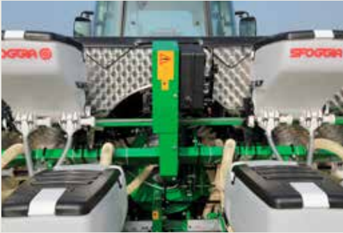
Microgranulators with PVC hoppers of 32 liters and 2 exits and 18 liters with 1 outlet, with volumetric distributors