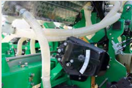
Fertiliser drive transmission Version Plus, with 3 cams variator